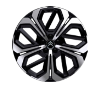
19" AERO-X DIAMOND CUT ALLOYS WITH ONYX BLACK PAINT & ONYX BLACK AERO INSERTS