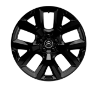
19" 'ART' FULL BLACK DIAMOND CUT ALLOY WHEELS